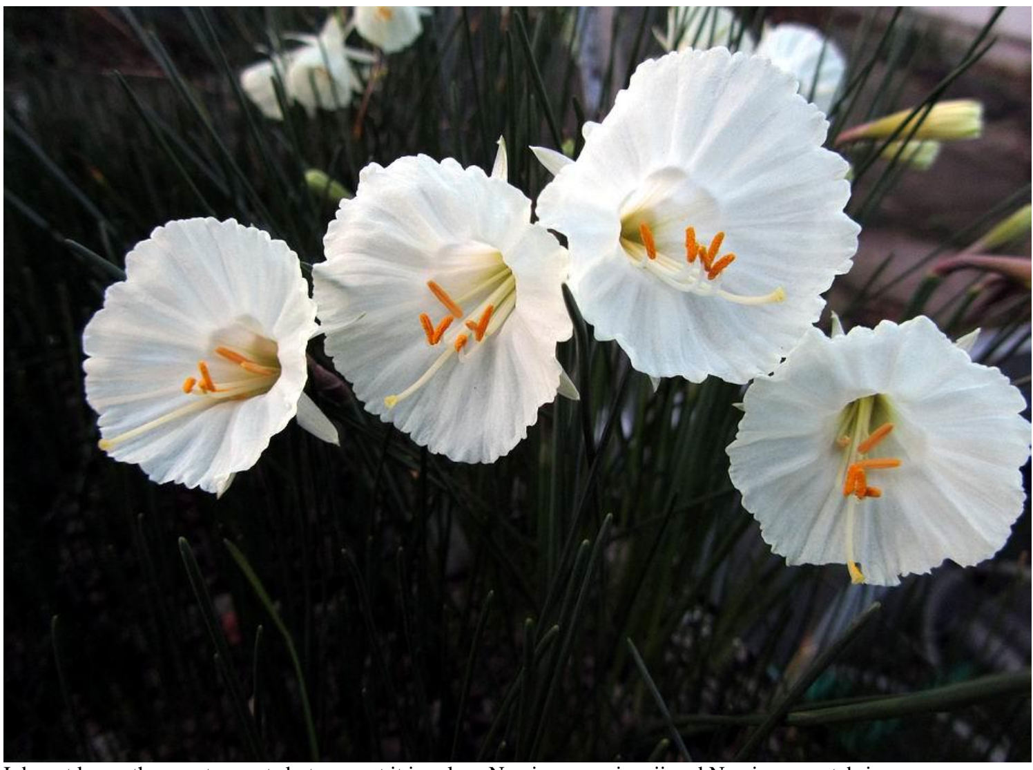
I do not know the exact parents but suspect it involves Narcissus romieuxii and Narcissus cantabricus.....