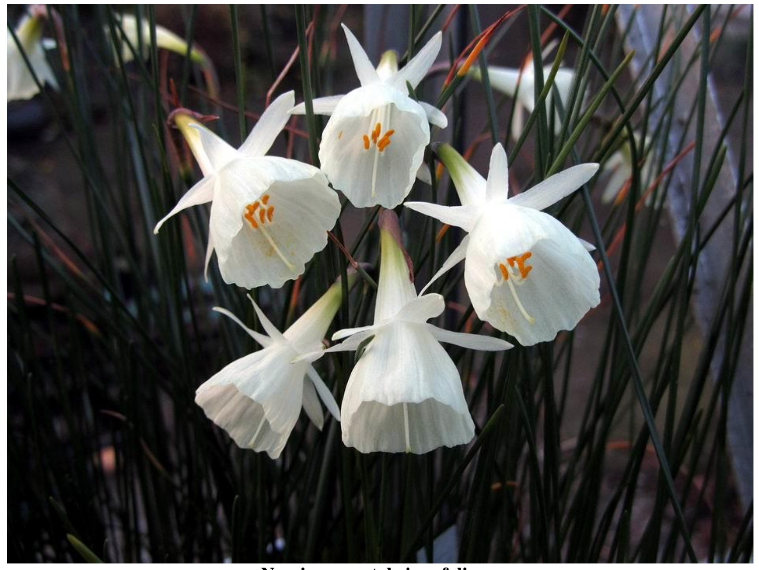
Narcissus cantabricus foliosus

We used to have masses of Narcissus cantabricus foliosus before the last big winter freeze a few years ago. We had not had a severe cold winter for a number of years and I got too casual in ensuring that all plunges were protected with warming cables resulting in big losses in the prolonged freezing conditions.