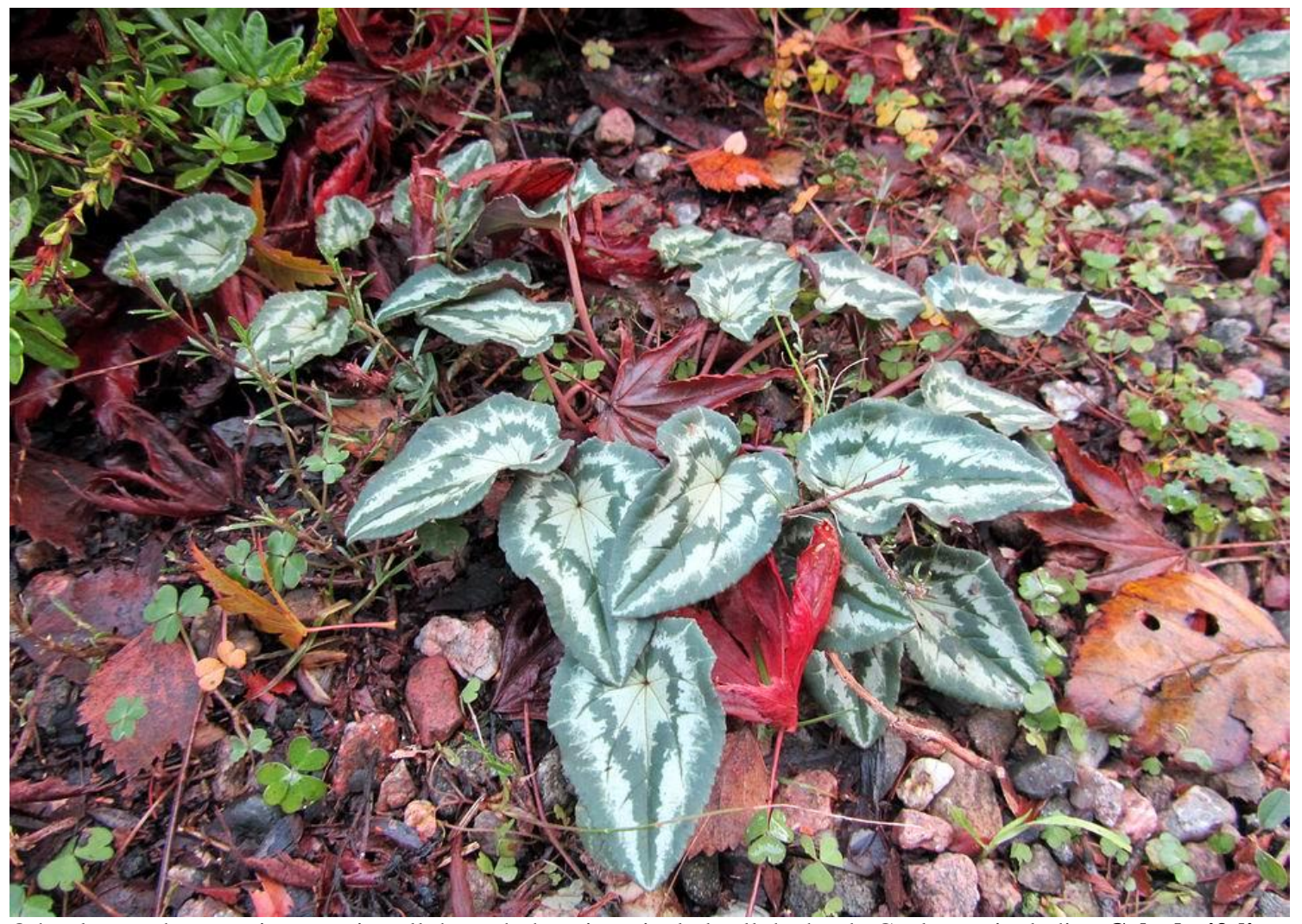
Other leaves that remain attractive all through the winter include all the hardy Cyclamen including C. hederifolium