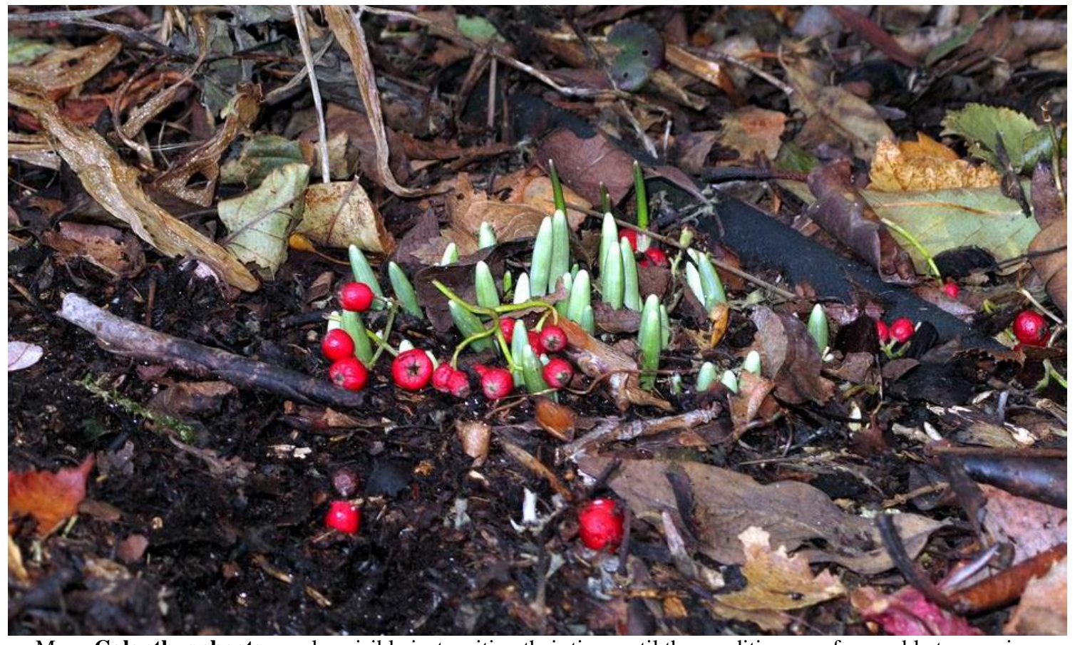
Many Galanthus shoots are also visible just waiting their time until the conditions are favourable to growing.