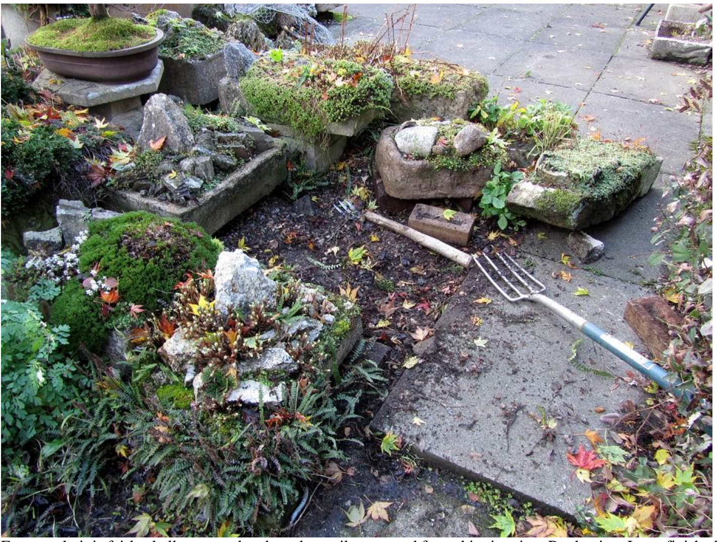
Fortunately it is fairly shallow rooted and can be easily removed from this situation. By the time I was finished there were no obvious signs of the fern left but experience tells me that there will be enough root or spores left for it to regenerate and in five to ten years' time I will have to repeat this process.

The problem is it runs by stolons and in time it will form a dense carpet that will smother out most smaller plants - we confine it to growing in a gravel area between some troughs. Even there it becomes too vigorous and needs controlling – the stolons even find the drainage holes in the bottom of the trough and if not removed they can take the trough over.