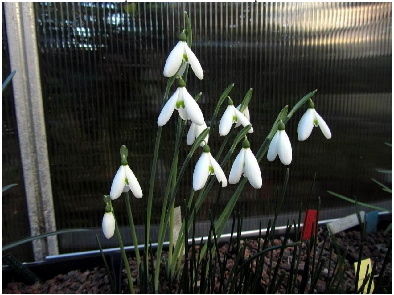
Galanthus reginae olgae flowers last a very long time in the cold conditions of the bulb house.