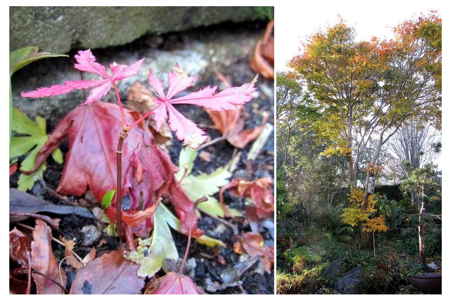
When I tell people that they should grow trees from seed they often say it will take them too long – but that is not always the case. I believe that after five years if you compare a seed raised tree planted out at an early age to a larger container bought one planted at the same time they will be much the same size but after ten years the seed raised plant will have overtaken the container grown one. The Acer on the right is one I raised from seed and is now some 4-5 meters high and is still holding onto its leaves long after the others have dropped theirs.