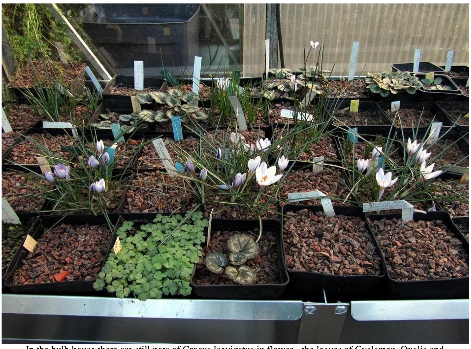
In the bulb house there are still pots of Crocus laevigatus in flower - the leaves of Cyclamen, Oxalis and Tropaeolum can also be seen in this picture