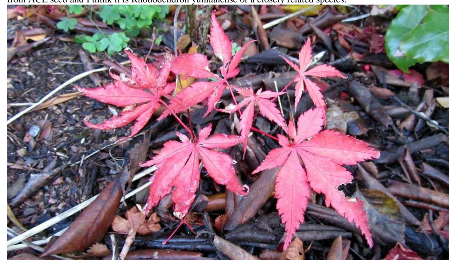
Sometimes seedlings just appear in the garden like this Acer seedling with bright red autumn colour that I found as I was clearing away the fallen leaves. I found another, shown below, one nearby.

For the most part Rhododendrons are not often associated with autumn coloured leaves but many will provide a colourful display. Although we call them evergreen the leaves do not last for ever - some leaves like those above last a little over a year turning colour and shedding in the autumn after the new growth leaves have established. Other evergreen species of Rhododendron hold onto their leaves for one, two or three years before they are shed. The colour in this species is further enhanced by the attractive red stems of the new growth. We grew this plant from ACE seed and I think it is Rhododendron yunnanense or a closely related species.