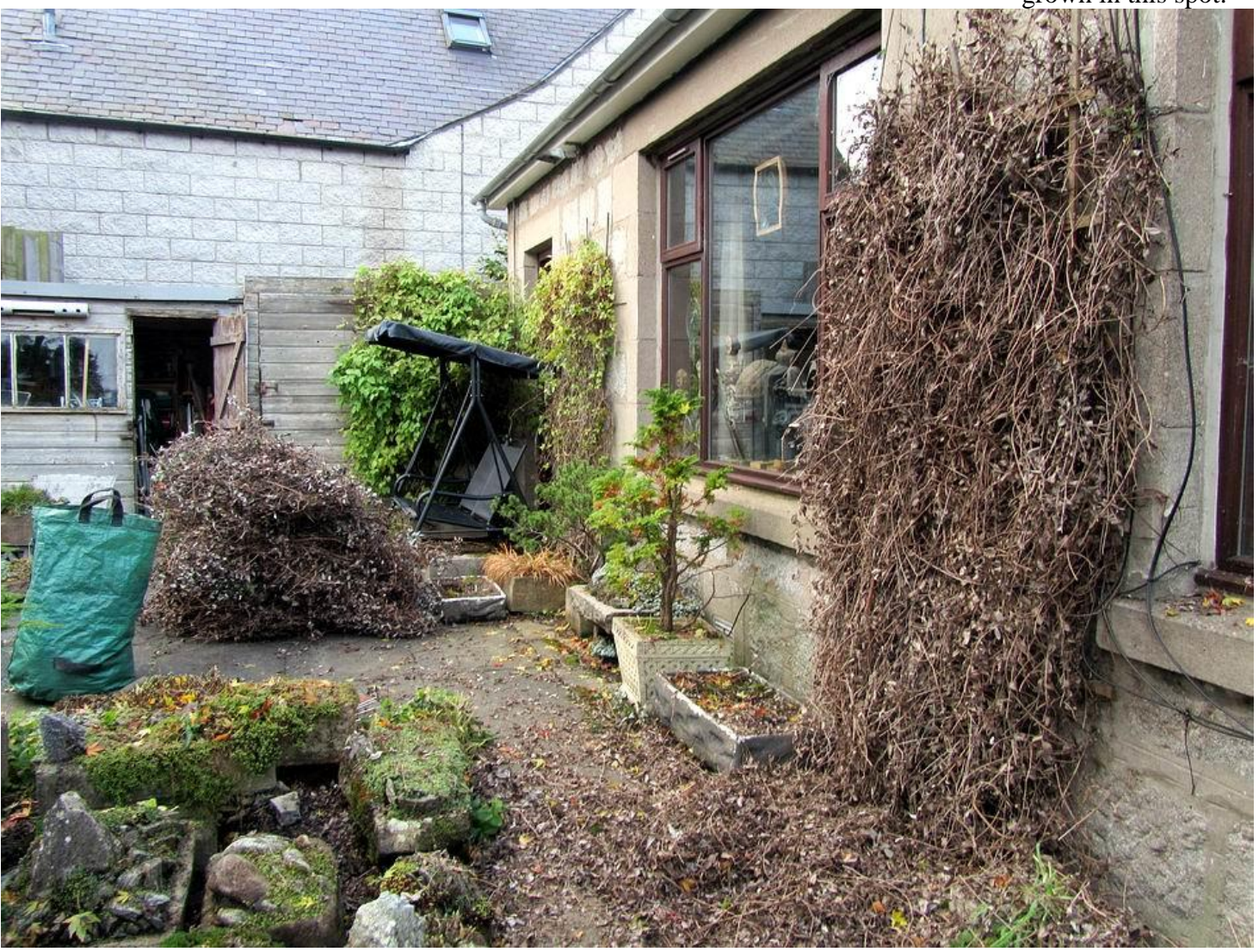
Removing the bulk of the growth is the first stage of the task and over the next few weeks I will trim back the individual stems now that I can see them properly. Some I will cut low down towards the ground to encourage a good new growth over the complete shrub and not just at the top. Now I have a big pile of trimmings that does not compact very well so how am I to get rid of it?

doing a half-hearted job it needs taken right back nearly to the wall. We have done this many times in the thirty odd years it has grown in this spot.