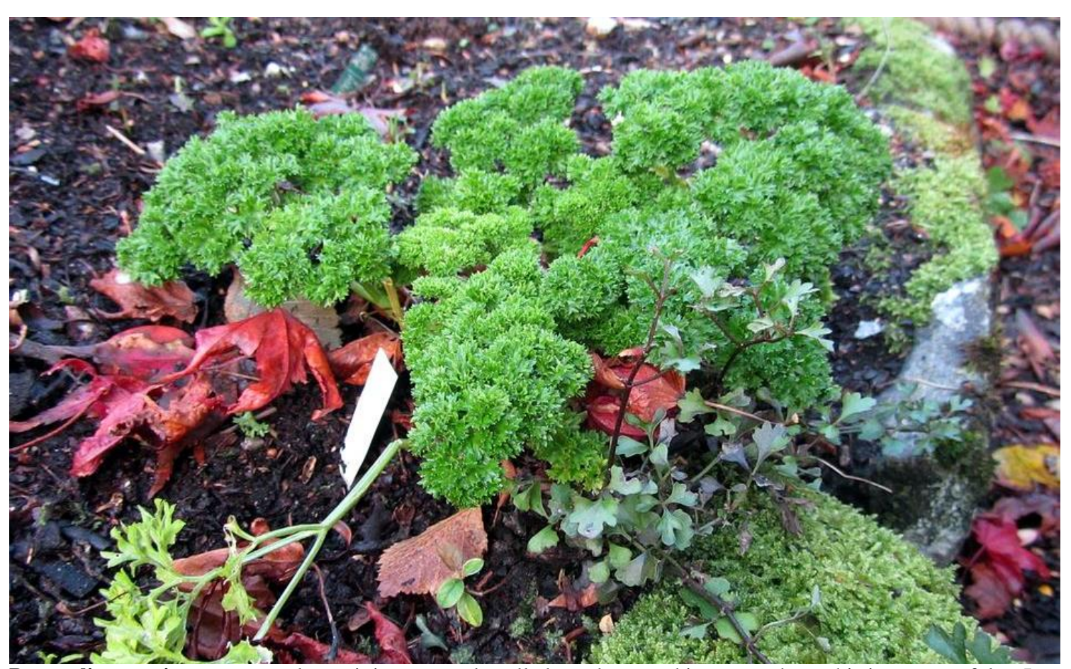
Petroselinum crispum , or parsley as it is commonly called, seeds around in our garden – this is most useful as I can always forage around and find some of this herb for cooking. Here it is growing with a clematis hybrid that I made many years ago –a three way cross involving Clematis marmoraria (twice) and C. paniculata.